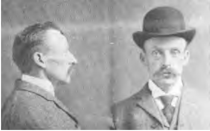
Cannibal killer Albert Fish